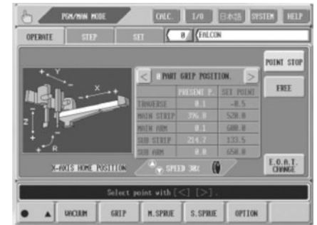
Manual maneuvering controls for maintenance