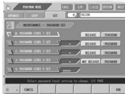
Password protected mold memories eliminate accidental deletion