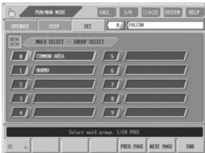
Features convenient mold data grouping, with easy retrieving and editing features