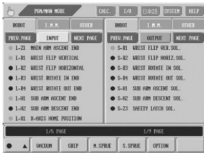
Two half-screen views allow simultaneous input and output monitoring